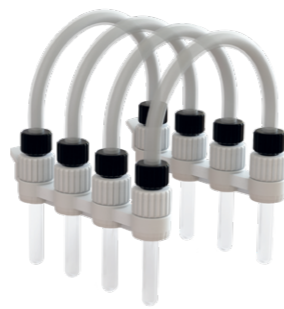
Vapor Diffusion set-up