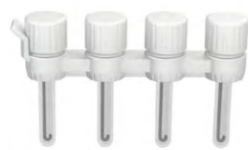
Multiple crystallization methods set-up