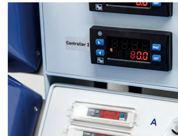
Close up controlled evaporation and vapor diffusion set ups

The two modules sit on top of the CrystalBreeder , maintaining a compact footprint. Users control the temperature, heat/cool rate, stirring speed and evaporation pressure for all disposable block reactors with the software, generating accurate solubility and crystallization data in a short time.